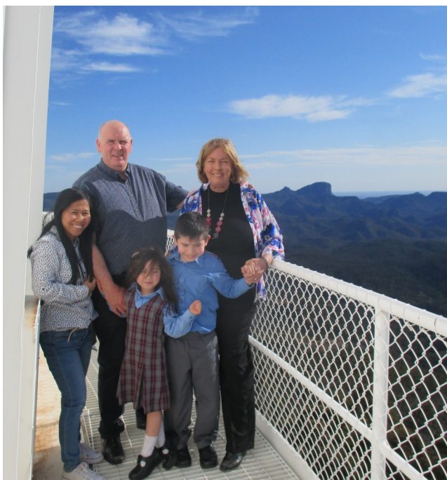
Some of us were brave enough to walk on the very high balcony around the main observatory