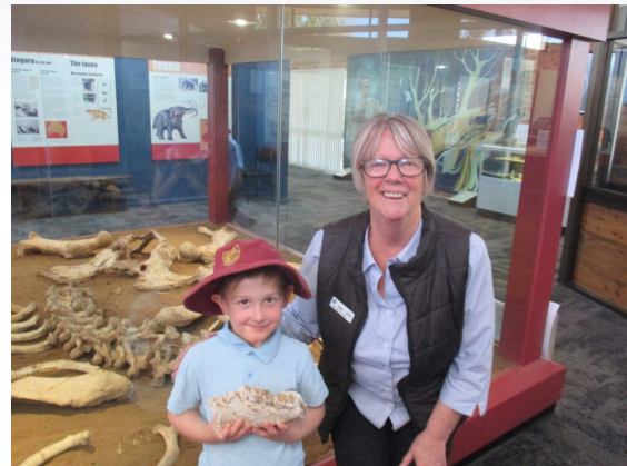
Tambar Springs' very own Diprotodon Fossil at the Coonabarabran Information Centre.