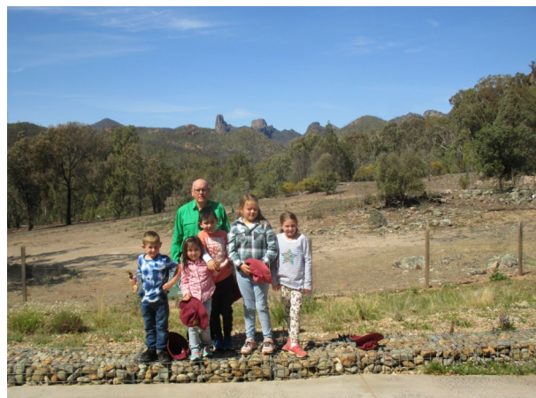
Bushwalking in the beautiful Warrumbungles.