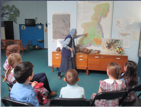
Learning about the Geology of the Warrumbungles at Crystal Kingdom.