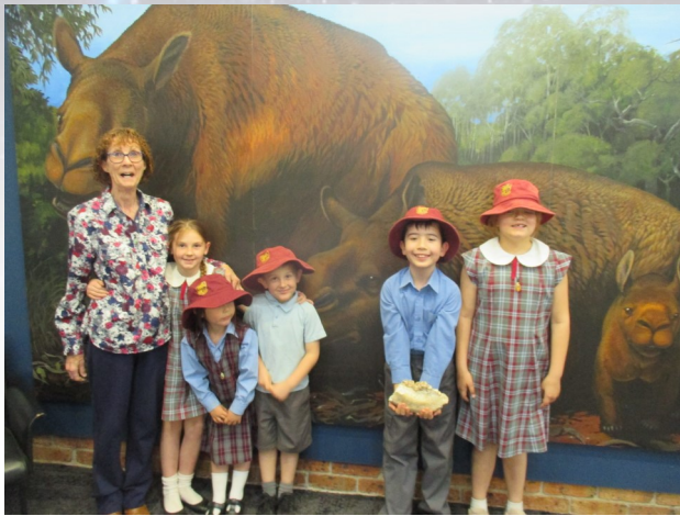
Examples of Megafauna that used to roam our region at Crystal Kingdom.