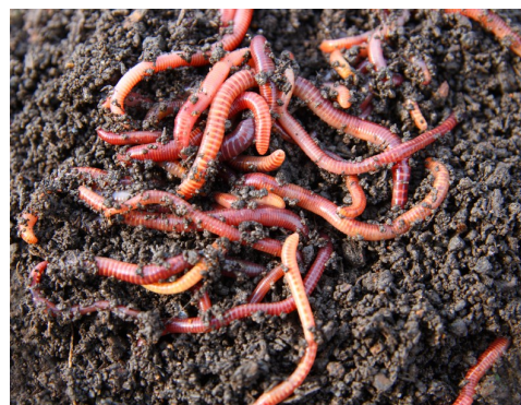
Our worm farm