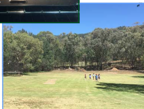
Fun on the field