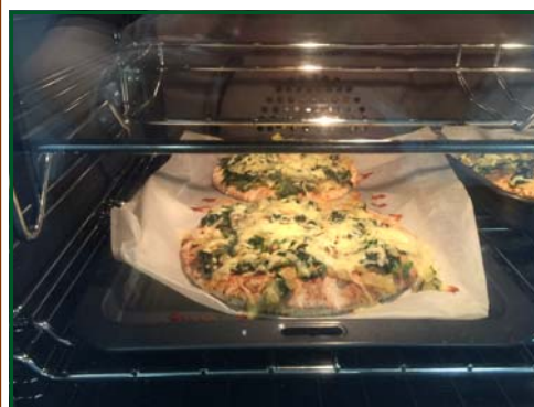
Tuesday's cooking class made Spinach and Cheese Mini Pizzas